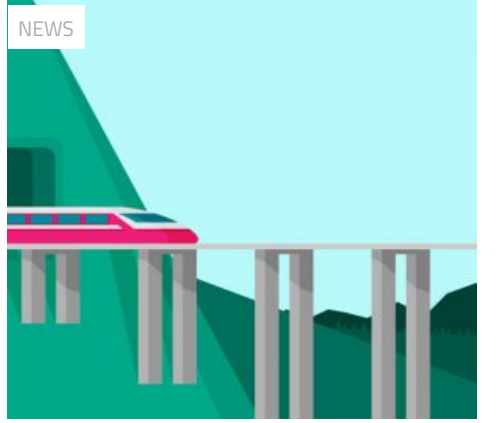
European Commission study highlights greater role of European rail