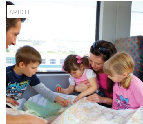
Implementing a development strategy to ultimately benefit passengers